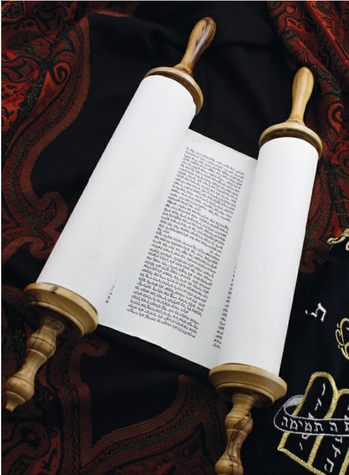
The Torah. The Torah, consisting of the five books of Moses, in a broader sense encompasses the entire range of Jewish thought and teachings.